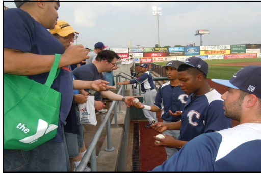
Riversharks' players autographing baseballs

The Scouts from Troop #364 were beyond excited to be a part of the action and they look forward to coming out to see another game.