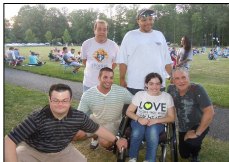
Perfect Pitch, Stepping Up to the Plate for Charity

autographed memorabilia, from athletes and celebrities among the likes of Don Larsen, Joe Girardi and the band Chicago among others.